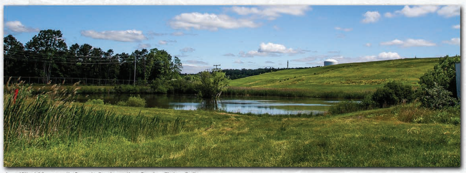
Landfill at Monmouth County Reclamation Center, Tinton Falls