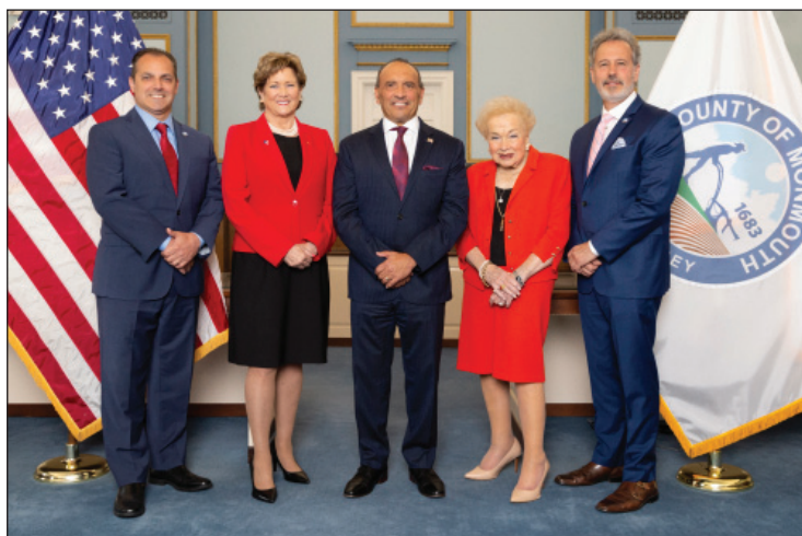
2023 Monmouth County Board of County Commissioners

Have a safe and happy summer! From, The Monmouth County Board of County Commissioners.