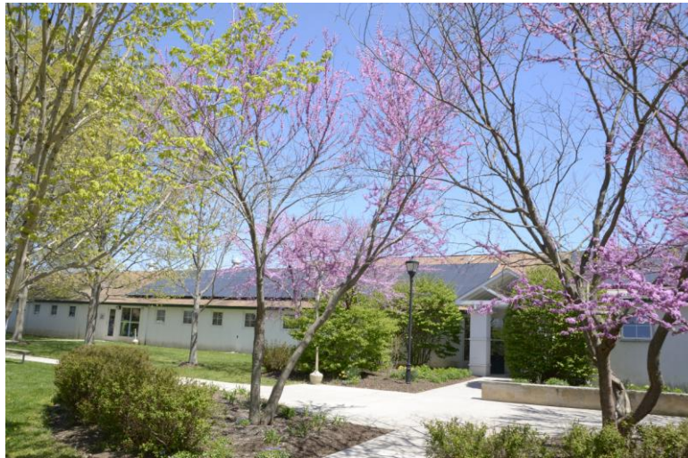
2 Creative Arts Center Spring