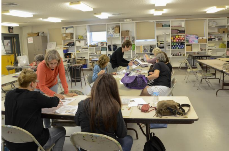
3 Adult Jewelry Class