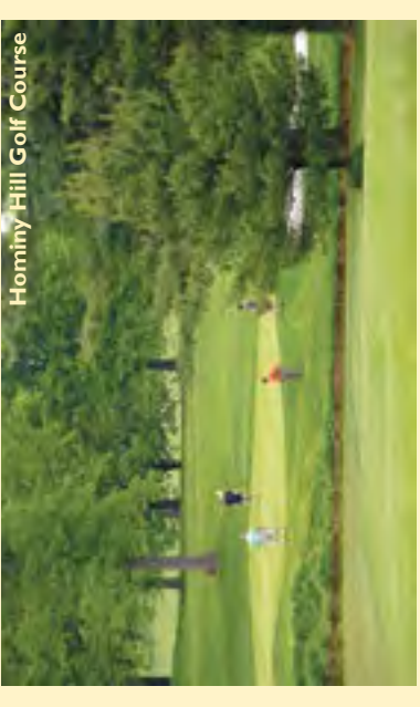
Tee up with us! Private club conditions at public course prices make Monmouth County's 8 golf courses one of the best values around.

Bel-Aire Golf Course, Allaire Road, Wall 732-449-6024 Charleston Springs Golf Course, Smithburg Road, Millstone 732-409-7227 Hominy Hill Golf Course, Mercer Road, Colts Neck 732-462-9222 Howell Park Golf Course, Preventorium Road, Howell 732-938-4771 Pine Brook Golf Course, Covered Bridge Boulevard, Manalapan 732-536-7272 Shark River Golf Course, Old Corlies Avenue, Neptune 732-922-4141