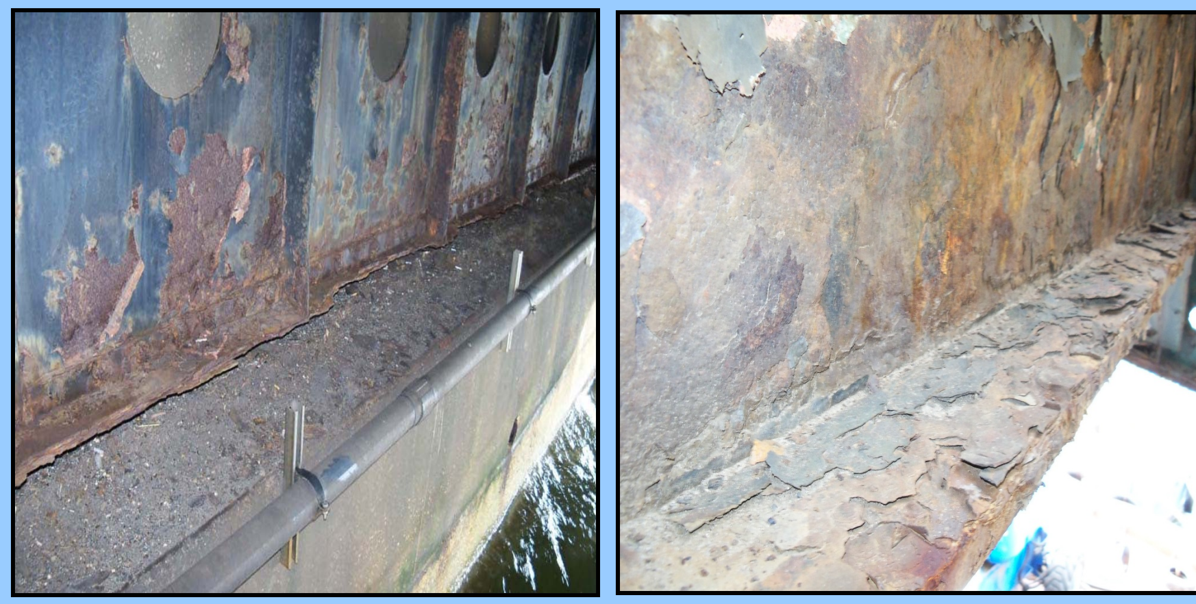
Span 10, End Floorbeam Over East Abutment, Looking Southeast.- Priority I Repair: Up to 90% Material Loss to Bottom Flange, West Leg, For Entire Length of the Beam. Overall Section Loss is Approximately 50%.