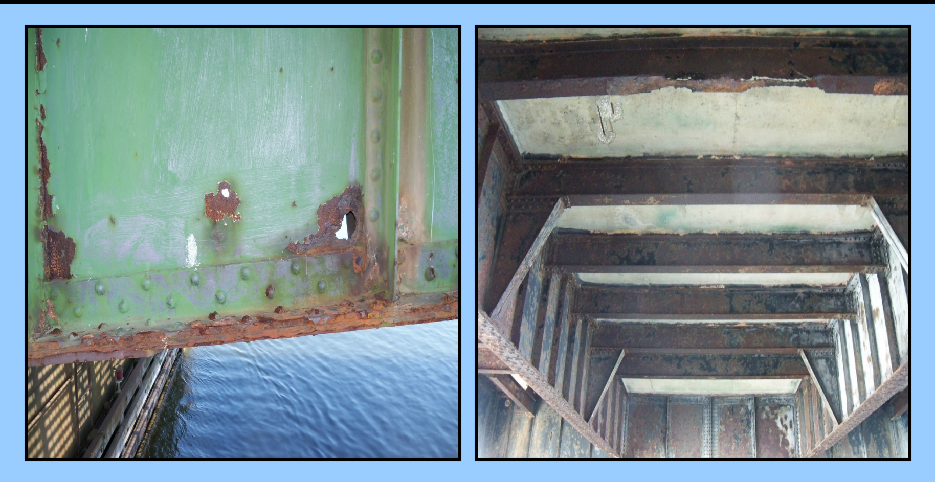
Eastern flanking span (Span 7) superstructure, heavy corrosion and rusting of floor beams, section loss of one floor beam