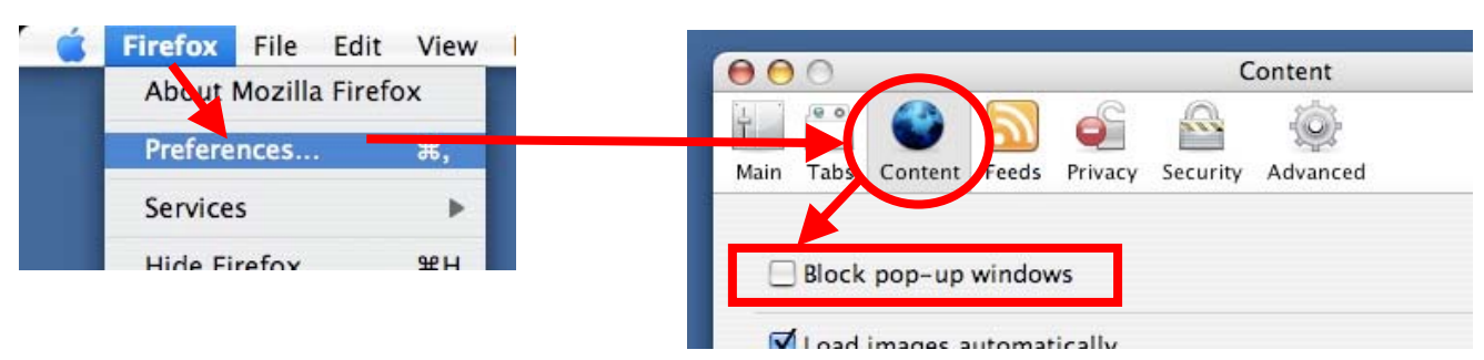
Firefox > Preferences > Content

There's just one way to turn off the pop-up blocker in Firefox