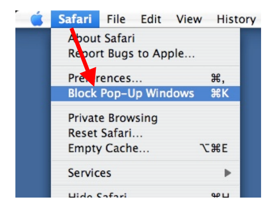
Safari > "Block Pop-Up Windows"

There are actually two different ways to turn the pop-up blocker on or off in Safari