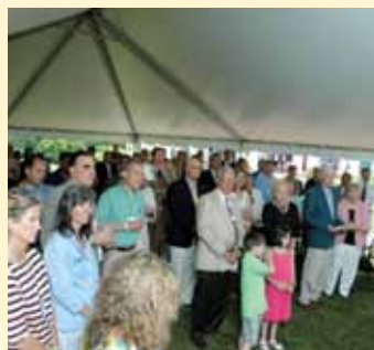
Gracious guests who braved the bad weather