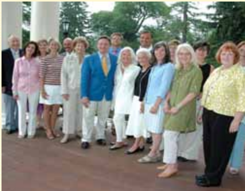
Friends of the Park Board of Directors

Wow, 50 years of providing open spaces and beautiful places for the citizens of Monmouth County to enjoy! The Friends were thrilled to host a birthday bash at the Thompson Park Visitor Center on June 13th. Over 150 party-goers joined us for the celebration which featured: tours of the historic buildings and ornamental gardens, craft projects, wildlife demonstrations, musical entertainment, refreshments and a commemorative keepsake.