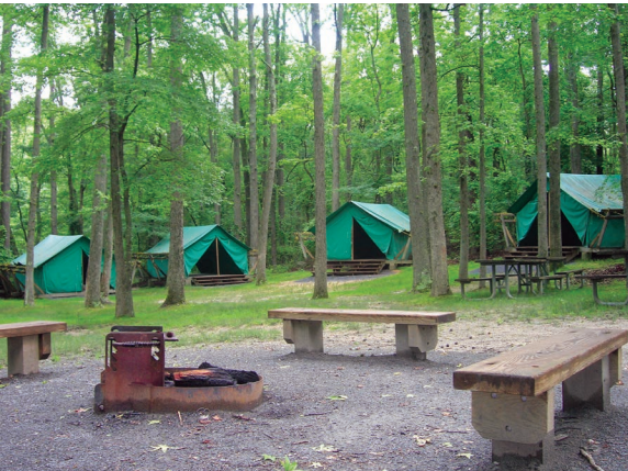
Fire ring area and platform tents at River Edge

Please make checks payable to “Monmouth County Board of Recreation Commissioners.” Fees and charges directly support your park system. A full refund for cancellations will be given only with 48 hours prior notice.