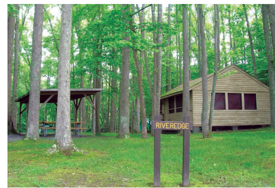
Picnic shelter and cabin at River Edge