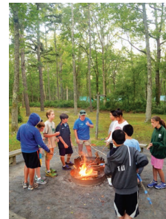
Campfire at Deerfield