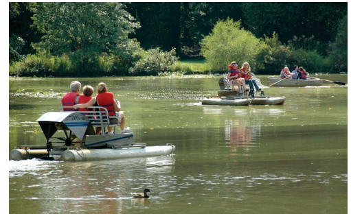
Paddleboats on the lake